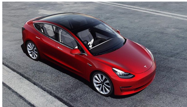
Tesla Model 3